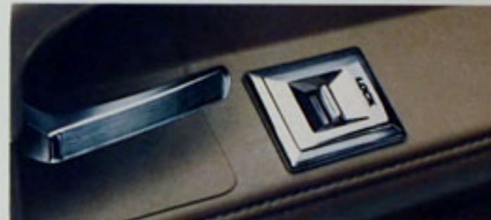
Power door locks