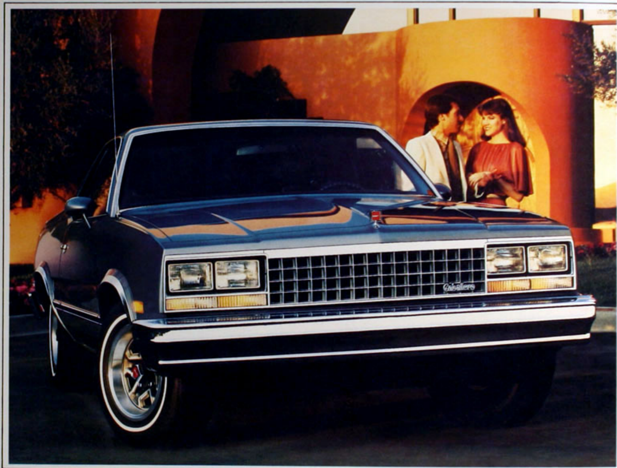
Caballero—dramatic truck decor.

All Caballeros have rugged coil-spring suspension front and rear together with a front stabilizer bar. Standard air-adjustable rear shock absorbers can be boosted with service-station air pressure to level the vehicle when carrying heavy loads. The air valve is located inside the fuel filler door. An optional Sport Suspension is available which includes higher-rate springs and upper control arm rear bushings,