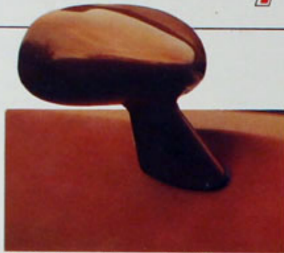
Sport mirrors LH remote, RH convex manual