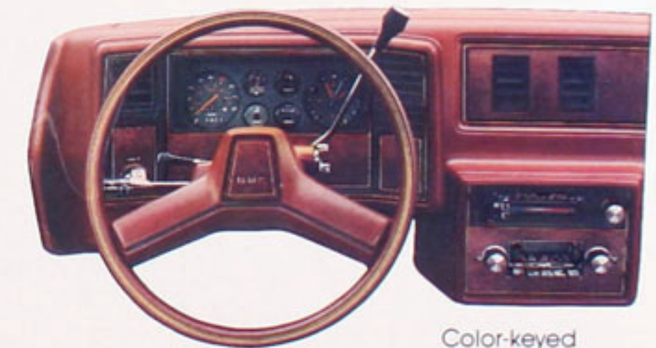
Color-keyed instrument panel

Ask your GMC Dealer for a Demonstration Drive.