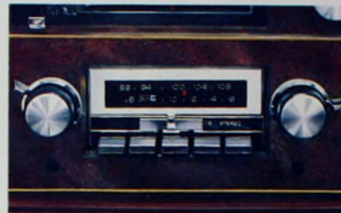
AM/FM stereo radio with cassette player