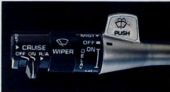
Automatic speed control with resume speed feature