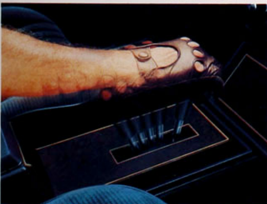
Available floor mounted center console with shift lever, stowage compartment and ash tray