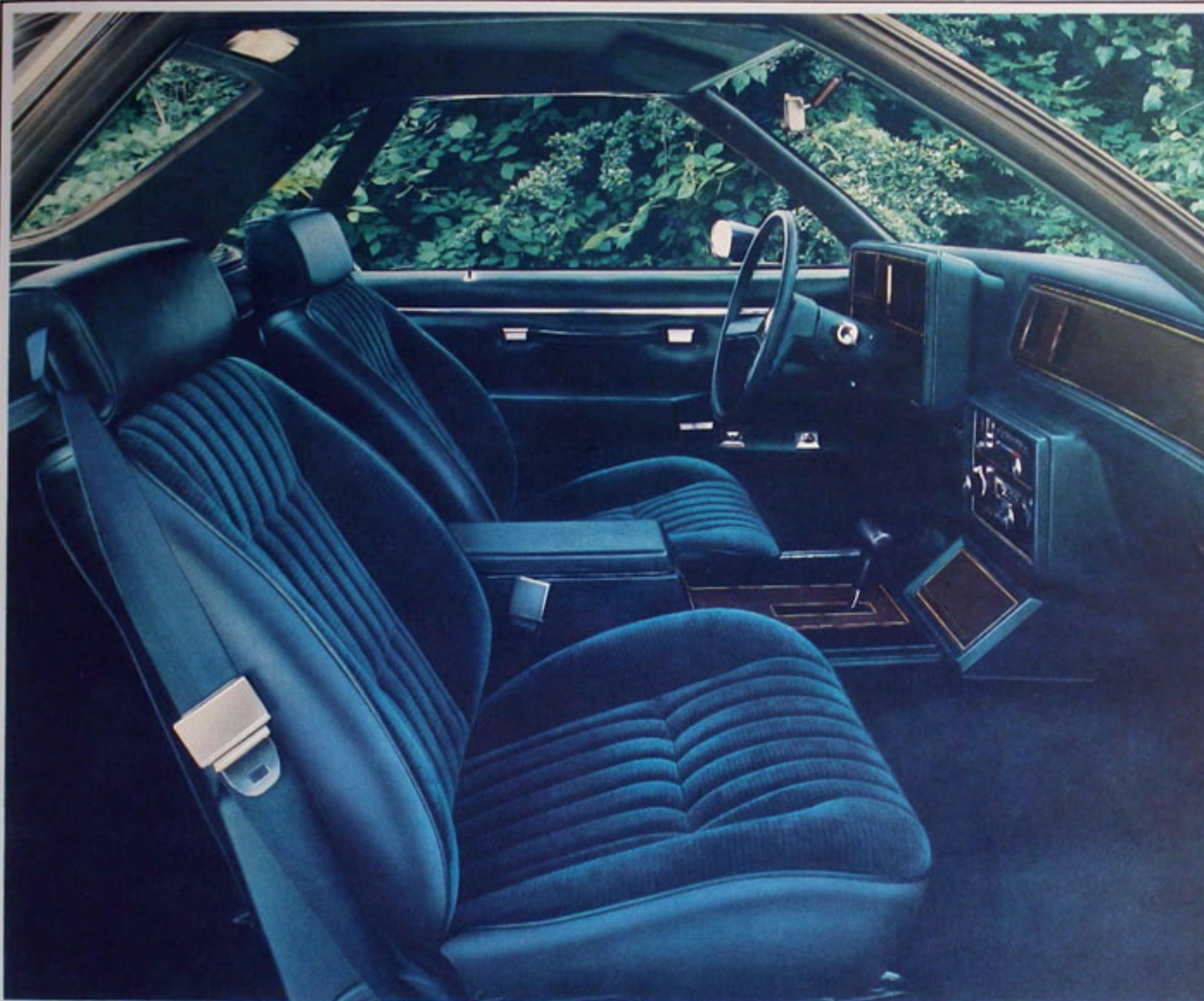
Available high-back bucket seats with cloth upholstery