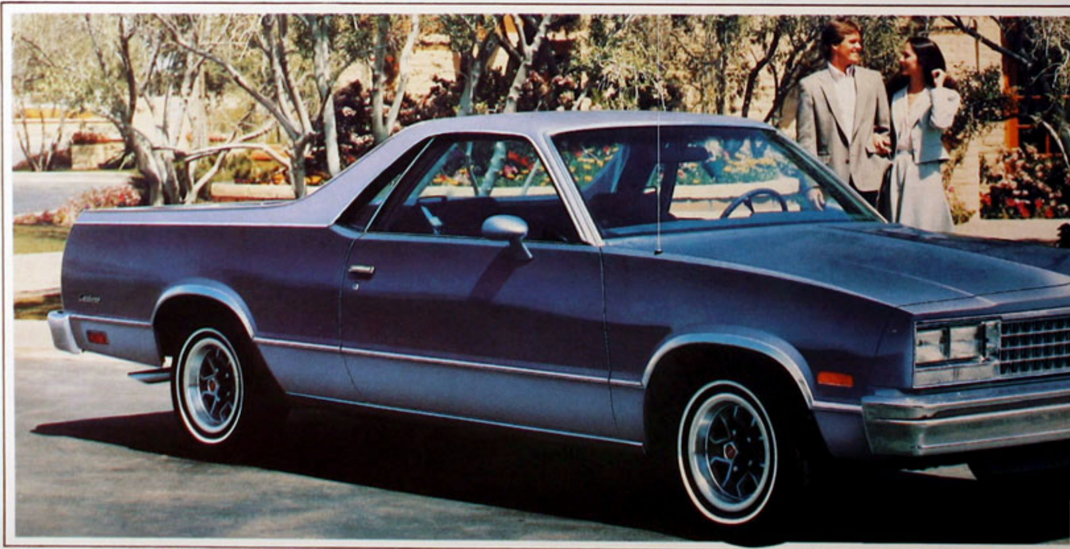
Caballero Amarillo is shown. Tires are supplied by various manufacturers.

Whatever Caballero model you choose, it can be equipped with a variety of available options and dealer-installed accessories. See page 4 for details.