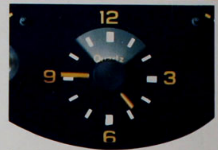
Quartz electric clock