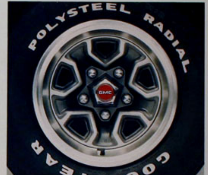
Rally wheel with trim ring