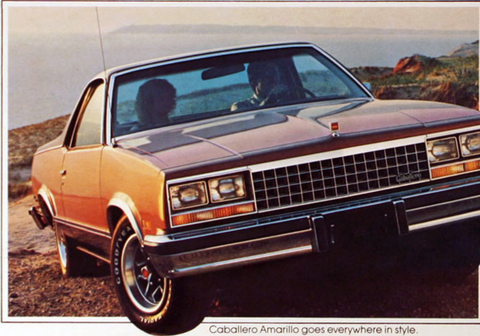
Caballero Amarillo goes everywhere in style.