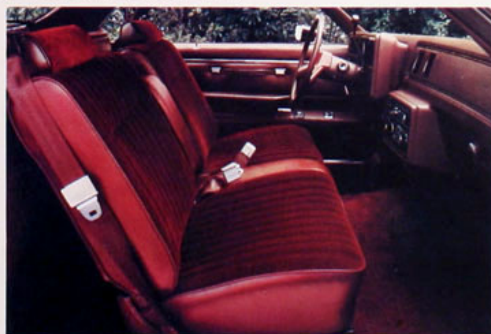
Available 55/45-split bench seat with new-design cloth trim