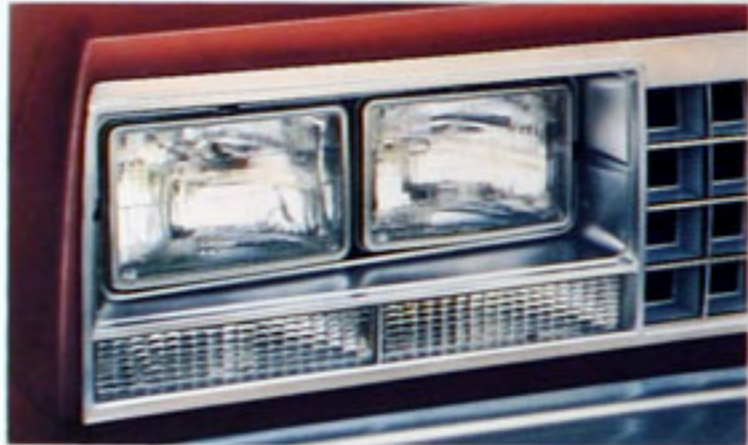
New hi-lo beam halogen headlamps